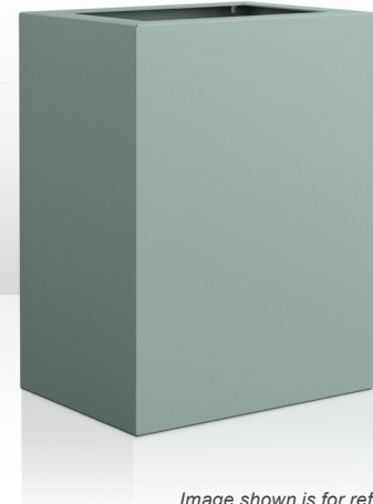
Image shown is for reference only. See table below for the accurate sizes and specifications.