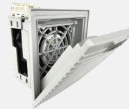
1. Open Grille