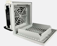
2. Remove Filter