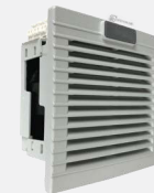
4. Close Grille