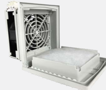
3. Insert Filter