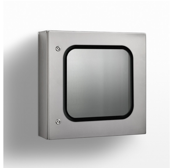
Image shown is for reference only. See table below for the accurate sizes and specifications.

Lock: Grade 316L stainless steel 8mm square drive quarter turn lock.