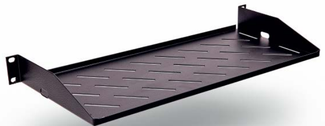
Orientation - B