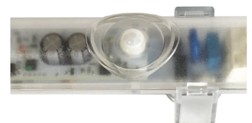
MOTION SENSOR TYPE