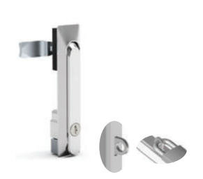
Low Profile Padlockable IP-L041 - Cast Alloy Coated Black IP-L042 - Cast Alloy Chrome