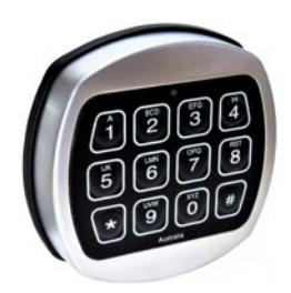
Keypad Entry IP-LE1 - Safe Lock with Electronic Entry Keypad