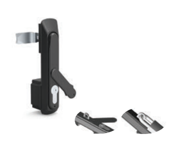
Swing Handle Padlockable IP-L074 - Cast Alloy Coated Black