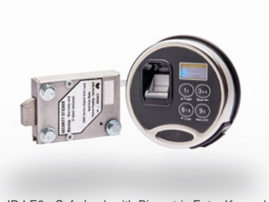
IP-LE3 - Safe Lock with Biometric Entry Keypad