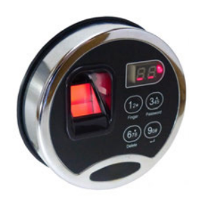
Biometric Fingerprint Entry IP-LE3 - Safe Lock with Biometric Entry Keypad