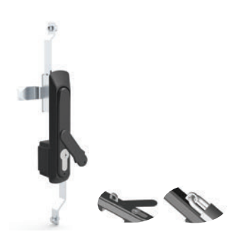
3 Point Swing Handle Padlockable* IP-L076 - Cast Alloy Coated Black