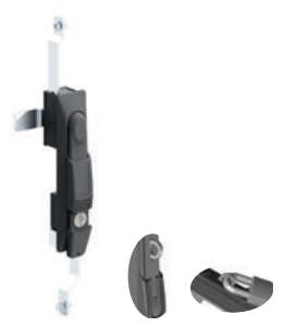
3 Point Swing Handle Padlockable* IP-L014 - Polyamide & Cast Alloy Coated Black