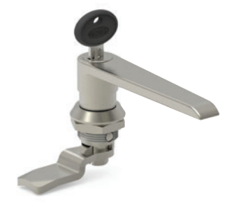
L Handle Keyed (Keyed Alike)