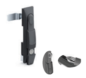
Swing Handle Padlockable IP-L009 - Polyamide & Cast Alloy Coated Black