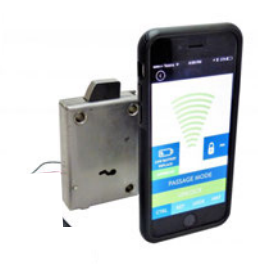
Smartphone Entry (Siri, App) IP-LE4 - Safe Lock with Bluetooth Entry