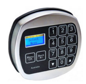
LED Keypad Entry IP-LE2 - Safe Lock with LED Electronic Entry Keypad