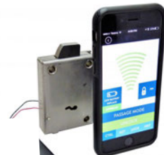
Smartphone Entry (Siri, App) IP-LE4 - Safe Lock with Bluetooth Entry