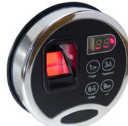
Biometric Fingerprint Entry IP-LE3 - Safe Lock with Biometric Entry Keypad