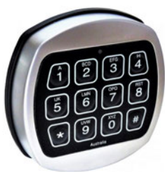
Keypad Entry IP-LE1 - Safe Lock with Electronic Entry Keypad

Australian made patented stainless steel high security electronic locks provide a keyless, highly secure and convenient entry solution. A range of entry pads are available including keypads, biometric fingerprint access and Bluetooth smartphone access. High security restricted key options are also available. (Requires door accessory for mounting. Available upon request. Contact IP Enclosures)