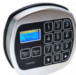
LED Keypad Entry IP-LE2 - Safe Lock with LED Electronic Entry Keypad