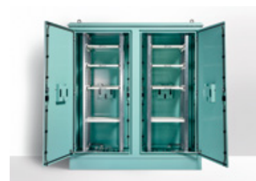
(Shelves not included)